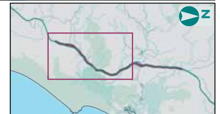
Figure 6-5A Property reference map