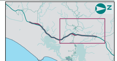
Figure 6-5B Property reference map